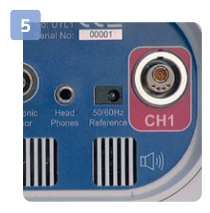
A phase reference is used to synchronise PD with the local power frequency, this is provided by either a plug in phase reference supplied with the instrument or optically from any nearby mains powered lighting source