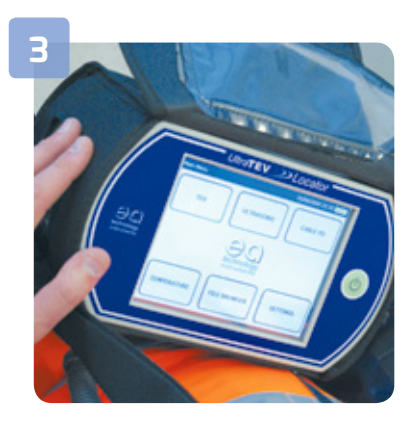
High resolution touch-screen - can be operated through the carry case cover