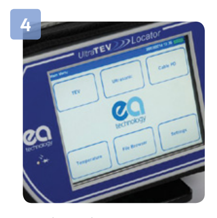
Simple touch-screen navigation between functions, including browser for stored data files