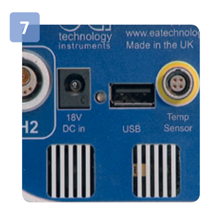
USB port for easy transfer of stored PD activity data to PCs. Also makes it simple to download and install the latest software updates