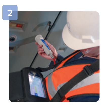
Can be carried halter-style or over-the shoulder