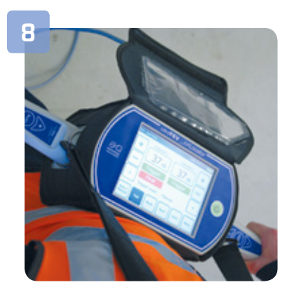
Integral Function Checker confirms the instrument is operating correctly