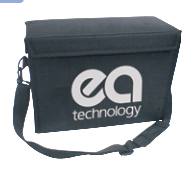
Weatherproof carry case